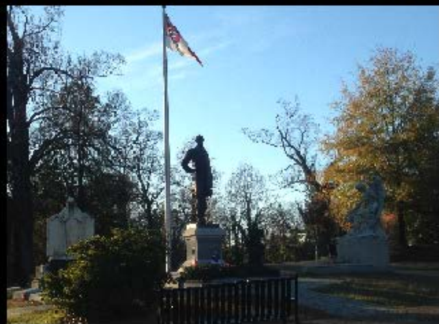
The Family and I took a recent trip to Hollywood Cemetery in Richmond. Jefferson Davis' grave is pictured.